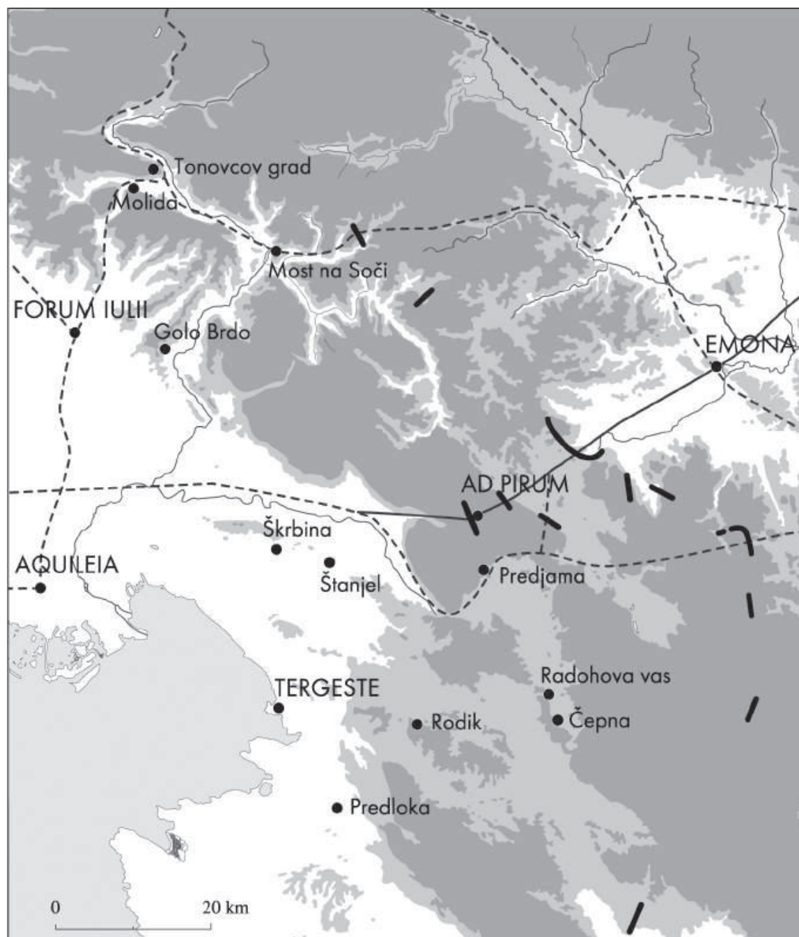
FIG. 1. Claustra Alpium Iuliarum and the sites of the first half of the 5th century.